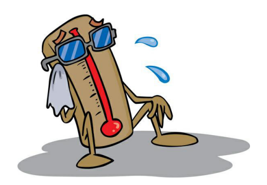
HAPPY LABOR DAY .....STAY SAFE!!!!!