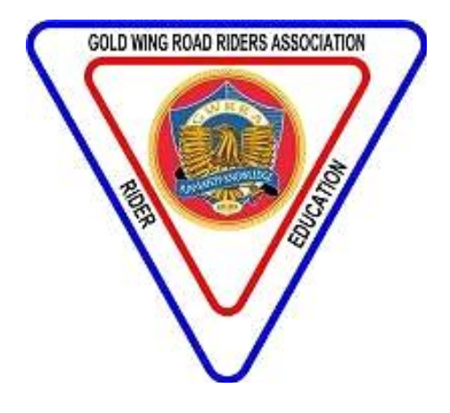
Rider Education Program Friends for Fun, Safety and Knowledge

Spending time with your Gold Wing Family is a great way to start the New Year. Those who are active in their home Chapter are happy GWRRA Members who are having a lot of FUN! Those GWRRA Members who are inactive are missing out on all the FUN.