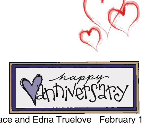
Wallace and Edna Truelove February 18 (TRUE LOVE never grows old!!!)