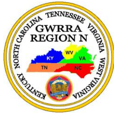
Region N GWRRRA NC – C2, Smithfield, NC