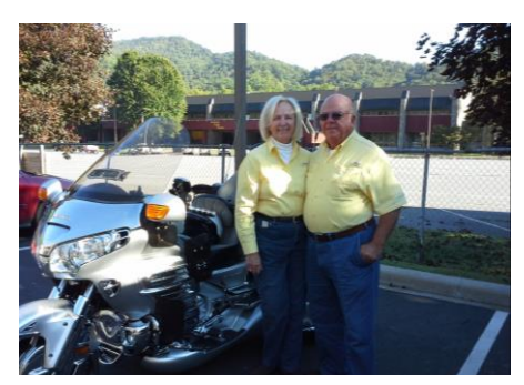
Greetings from your Road Captain and Ride Coordinators: