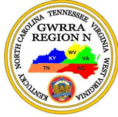
Region N GWRRRA NC – C2, Smithfield, NC