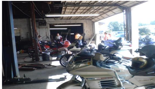
C2's Annual Maintenance Day – September 20, 2014