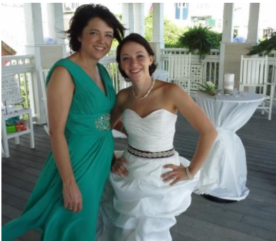
Mother and daughter

Another wedding event was the marriage of our oldest granddaughter. It was on the oceanfront and was absolutely beautiful. Of course, as grandparents, we think so!